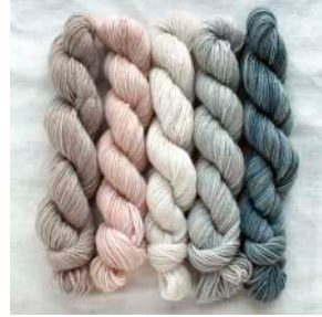
#3 - Clarissa