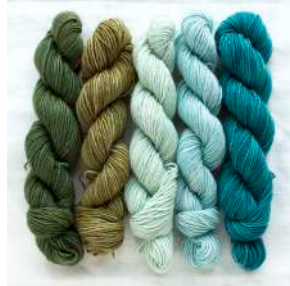
#6 - Flora