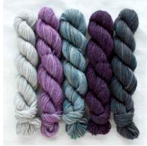
#2 - Beatrix