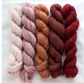
#5 - Eleanor