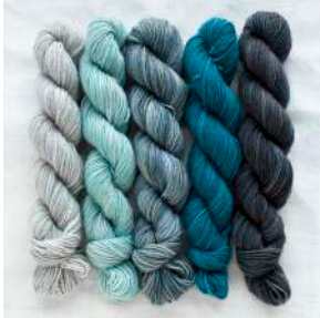
#1 - Augusta