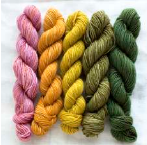
#4 - Dorothea