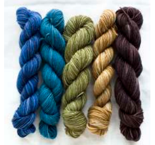
#7 - Georgiana